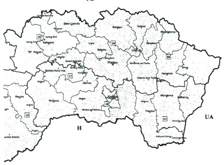
Fig. 1. East Slovakia with the tourism regions marked by numbers. Explanations: 13 – Gemer/Gömör, 16 – Tatra/Tátra, 17 Spis/Szepes, 18 Kosice/Kassa, 19 Saris/Sáros, 20 Upper Zemplin/F. Zemplén, 21 – Lower Zemplin/A. Zemplén ( Adapted from: www.economy.gov.sk)

For our research, Kosice County was divided into units containing approximately 10 settlements, where a comprehensive set of data was collected (Tab.1; Timčák 2006). As already mentioned, field data were collected mostly by BSc and MSc students during the work on their thesis. The coordinates were taken by Garmin Venture Cx GPS unit. Digital photographs were taken not only of objects of historical, cultural, leisure or administrative interest, but also hospitality related objects. Furthermore, photographs were taken of traditional rural buildings that could be of interest for rural tourism development.