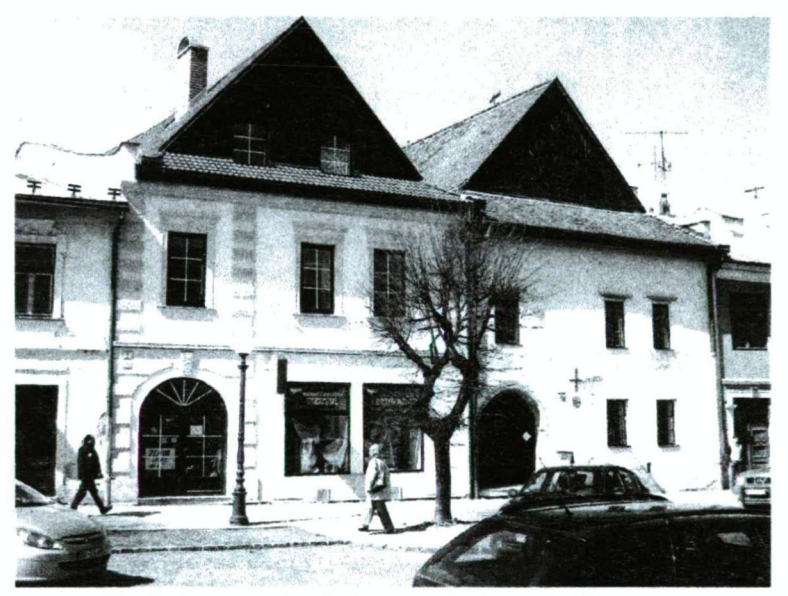
Fig. 3. An example of photographs taken in Kezmarok and listed in Fig.2 (KEZ 43) (Hric 2008)