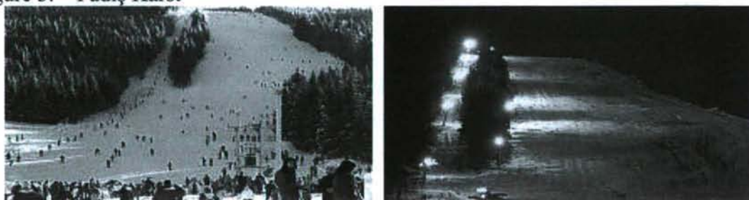
Figure 4 – The ski slope from Vârtop