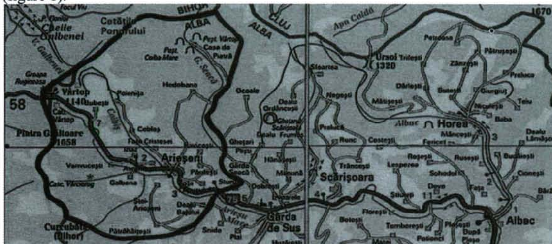
Figure 1 - Administrative-territorial repartition of the zone Vârtoș-Arieșeni with all its localities

Arieșeni commune comprises the localities: Arieșeni – commune centre, Avrămești, Bubești, Casa de Piatră, Cobleș, Dealu Bajului, Fața Cristeșei, Fața Lăpușului, Galbena, Hodobana, Islaz, Păntești, Pătrăhăitești, Ravicești, Sturu, Ștei-Arieșeni, Vânucești (figure 1).