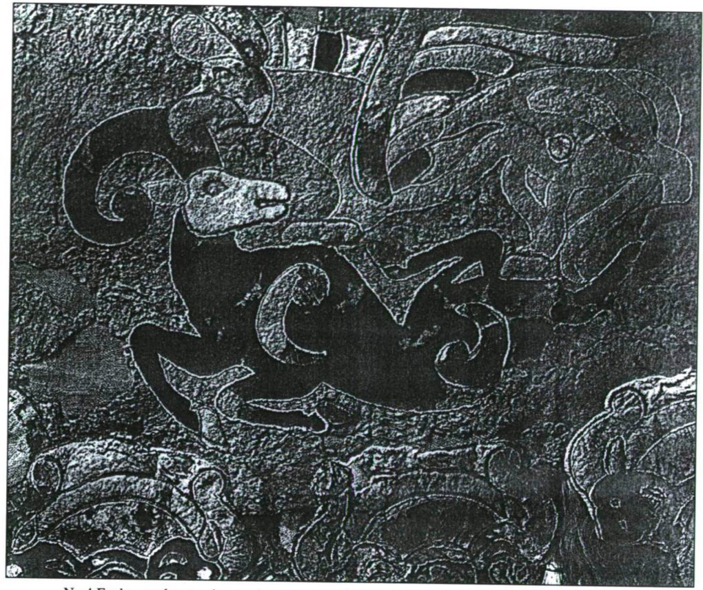
No 4 Eagle, gryphon tearing to pieces a mountain ram. Felt saddle cover (First Pazyryk Barrow)