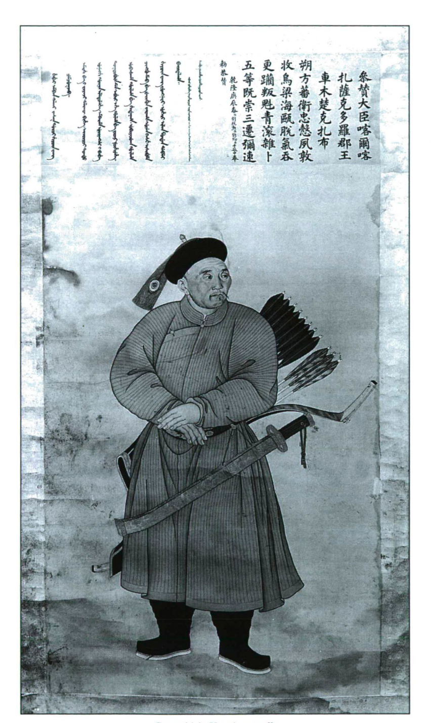
Cemcukjab. Hanging scroll.