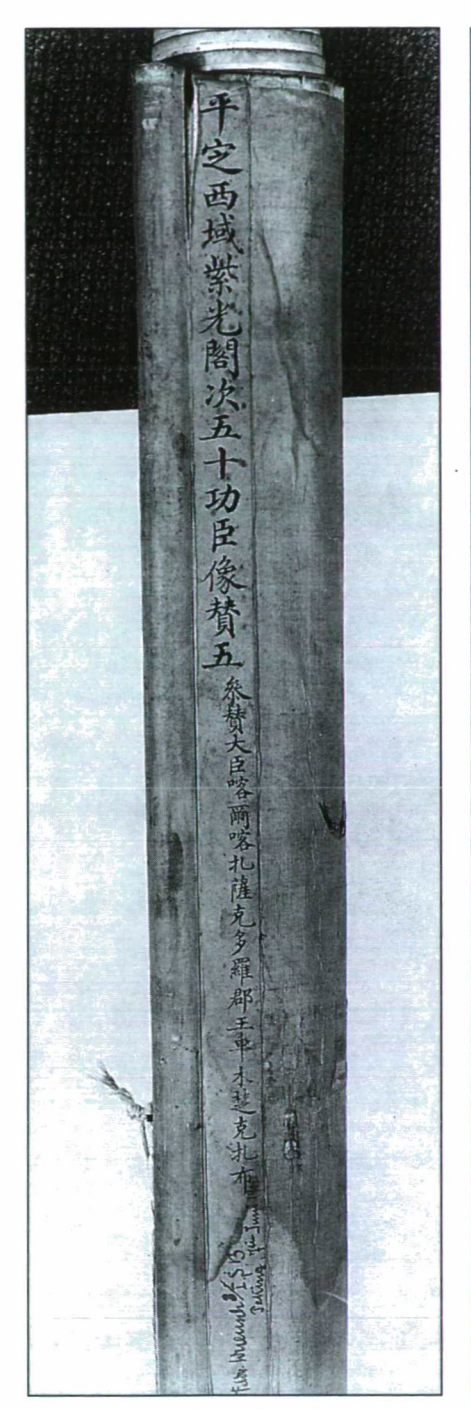
Cemcukjab. Inscription on the outside of the scroll.