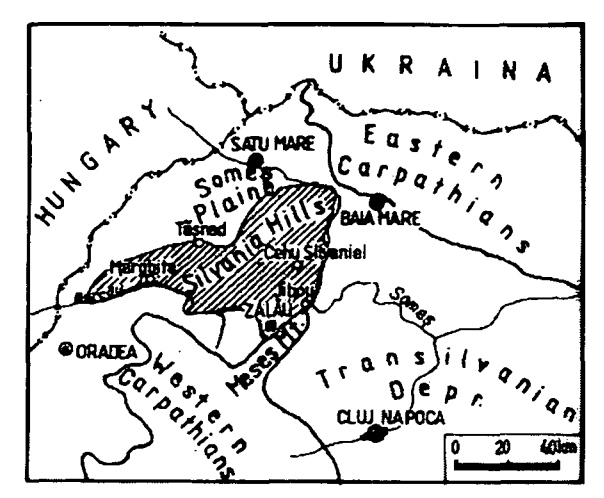
Fig. 3 Silvania hills georgaphical position in the North-West of Romania

not been completed yet. However, we can highlight the existence of several components of of several system and subsystems, which can be integrated into larger settlement systems polarized by capitals and with territories in the Silvania Hills. This calls for the identfication of four general settlement systems that have as centres Zalău, Oradea, Satu Mare and Baia Mare. The polarizing tendency is both administrative and economic, due to the influence of the industry and the service diversity offered (Fig. 3).