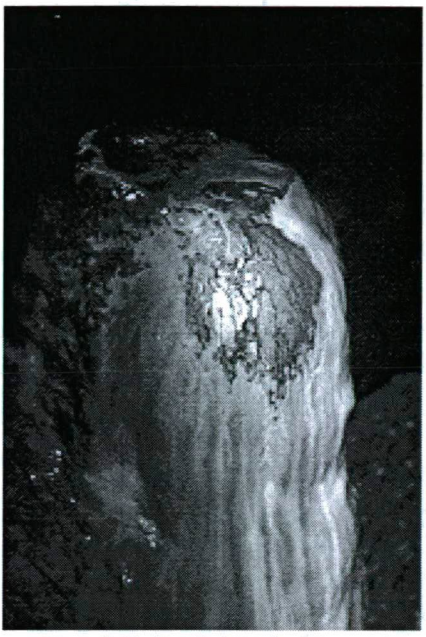
Photo 1 Redissolution of a dripstone in the Baradla Cave (Aggtelek Karst)

Evaluating ecosystem services may help improve water quality, because the investments needed may be financially comparable with 'the price' of maintaining the present state. E.g. in 2006, thousands of people were taken ill because of the polluted water during a karst flood, and some karst springs were excluded from the drinking water supply in the surroundings of Miskolc, because of coli infection (Lénárt 2006). If we take into consideration the damages in other services, the total costs of interventions needed, these