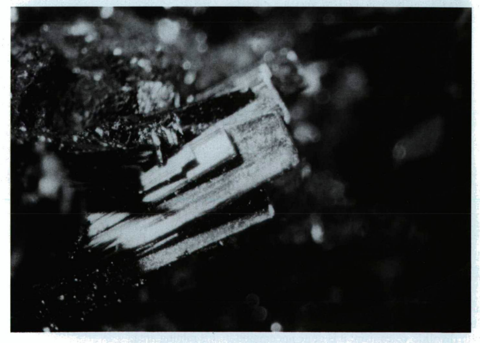
Fig. 2. Chalcostibite crystal from Felsőbánya (25x)