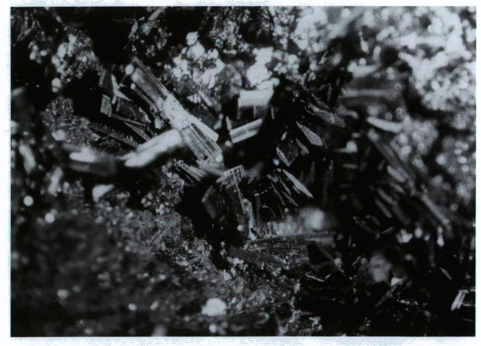
Fig. 4. Sheaf-like crystal group of chalcostibite on chalcopyrite (10x)

From an economic geological point of view, the ore deposit near Felsőbánya is a subvolcanic meso- and epithermal ore mineralisation that dominantly has the so-called Pulacayo-type Pb-Zn veins (SCHNEIDERHÖHN, 1962). The ore deposit is in connection with rhyolitic volcanism; it is quite uncommon in this mining area.