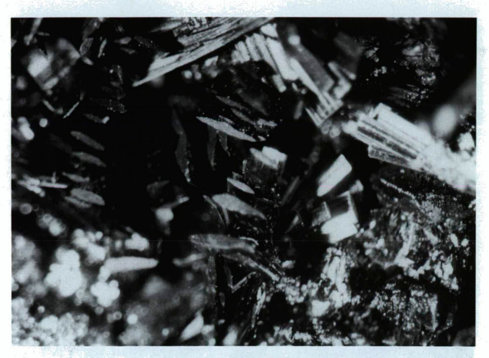
Fig. 1. Chalcostibite from Felsőbánya (15x)