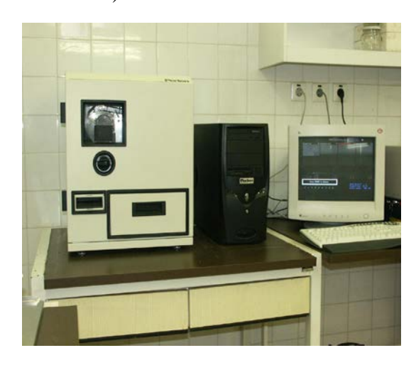
Fig. 1. SKCS 4100 instrument (Perten, Inc.)

and moisture content, as well as the HI. This machine examines 300 whole kernels. (Szabo et al., 2005; Bean et al. 2005)