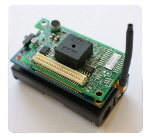
Figure 1 The Crossbow wireless mote

Wireless sensor networks are useful because there is no need for wires and this provides the possibility to measure quantities which were not possible in the past. Measuring in highly explosive risk areas was a problem due to the potential levels of grounds. Highly corrosive vapours in the air damage the cabling of sensor networks requiring frequent maintenance. Wireless sensor networks are successfully used in forest fire detection systems, monitoring of agricultural microclimate, monitoring of traffic structures and their load (Gogolak et al 2010). The Crossbow IRIS (Fig. 1) wireless sensors nodes compliant with IEEE 802.15.4 standard were used for measurement of the RSSI values. Crossbow technology has compact wireless modules with complete software support. The 2.4 GHz modules have an 8bit low power microcontroller on-board and a wireless stage. The Atmel 1281 microprocessor is easy to program and has wide software support.