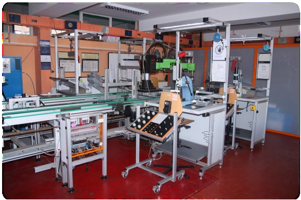
Figure 3 The industrial laboratory

In the second phase of our experiment the process of localization was done in industrial environment, in an industrial laboratory equipped with an assembly line for assembling water pumps. This industrial laboratory provides the conditions of an industrial environment for studying wireless communication and localization processes (Toman et al 2009, Sárosi 2012). Fig. 3 shows the industrial laboratory.