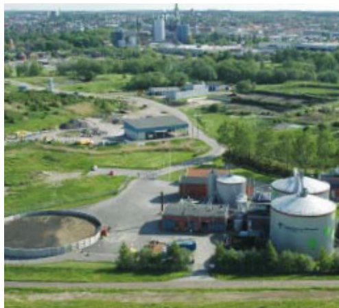
Figure 4. Biogas plant in Linköping, based mainly on municipal wet organic wastes [17]