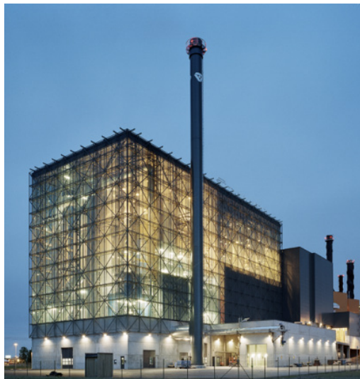
Figure 3. The now 80 MW capacity Linköping waste incineration plant [11]

Linköping has an existing waste incineration plant (Fig. 3) with a capacity of 250,000 tonnes of waste a year and is investing in order to increase the capacity to 350,000 tonnes of waste a year. The base supplier of heat is the waste incineration plant with a total capacity of 70 MW and an additional 10 MW from flue gas condensing. Electricity can also be produced by a steam turbine integrated with an oil-fired gas turbine, a so-called hybrid system. The hybrid system has a capacity of 47 MW el [7].