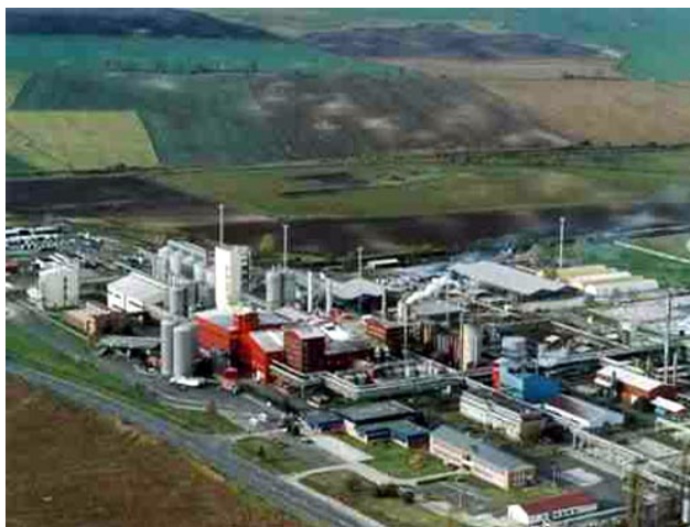
Figure 2. Hungrana facilities producing ethanol [7]

Biofuels are made from rural biomass. A good example is ethanol, nowadays mainly produced out of corn in Hungary. The main capacities are owned by Hungrana Ltd., which is processing around one tenth of the yearly domestic corn production (Fig. 2).