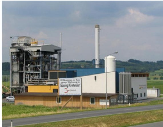
Figure 1. A 2 MW wood-chips power plant in Güssing, Austria (ca. 3000 inhabitants) [6]

According to our calculations [6], with ca. 1.2 billion HUF investment this type of a wood chips based power plant can be established within 2 years, paired with a discounted payback period (DPP) of 5.6 years in case of at least 80% heat utilization and no financial support, and with 1.2 years in case of an additional 50% investment support. The employment increase amounts to 350 people including the 20 people serving the power plant. The energy plantations need 1400 ha area.