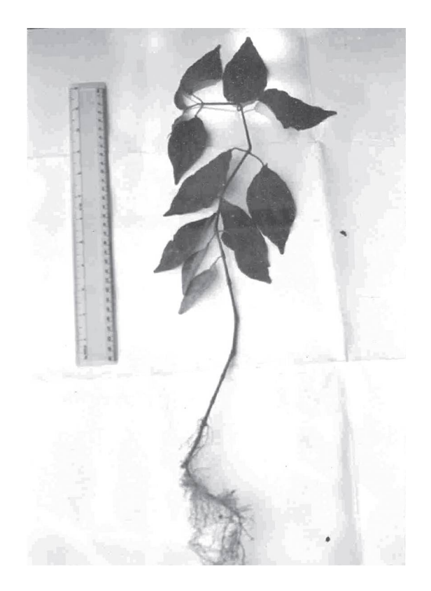
Figure 1. The plant Clerodendron thomsonae Balfour.

stream to be toxic (Elpel 2000), but fish assimilate saponin directly into their blood stream via their gills. Fish poisoned by saponins become stupefied and float to the surface where they can easily be collected. Saponins have been shown to inhibit cholinesterase; trypsin and proteinase activities (George 1965). The biological activity of saponin such as anticancer and anti cholesterol activity has led to the emergence of saponins as commercially significant compounds with expanding applications in food, cosmetics, and pharmaceuticals sectors (Güclü-Ustundag and Mazza 2007). They have also been reported to reduce the more harmful LDL-cholesterol selectively in the serum of rats, gerbils and human subjects (Potter 1993; Harris et al. 1997; Matsuura 2001). They are soluble in ethanol, methanol, water or mixture of water with methanol or ethanol (Gennario 1985). Some are exceptions to these characteristics e.g soybean do not form complexes with cholesterol. Ladino clover saponin is not toxic to fish and does not haemolyse red blood cells (Walter et al. 1955). Saponins occur in more than 90 families (Chandel and Rastogi 1980) and at least 500 genera of plants (Basu and Rastogi 1967). A certain plant and even part of the same plant may contain different saponins which can differ in bulbs, blossoms and fruits (Fenwick and Oakenfull 1981). Saponins have been found in legumes, soybean (Fenwick and Oakenful 1981; Shi et al. 2004), sugar beet, spinach asparagus and horse