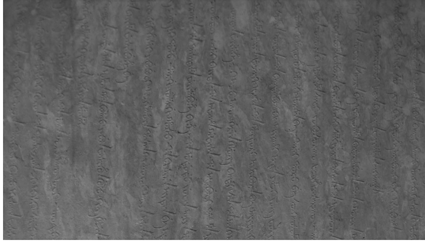
Figure 2: Manchu inscription (source: KAO, 2016, Beijing, photo)

An example of inscription from Fig. 2, named the Stela of the Restoration of the Pusheng Temple (普勝寺重修碑), carved in 1744 is shown below. The Manchu text is written in the middle, the Mongolian in the right, the Chinese in the left.