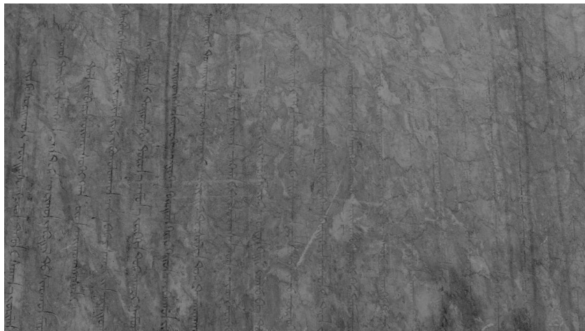
Figure 3: Mongolian inscription (source: KAO, 2016, Beijing, photo)