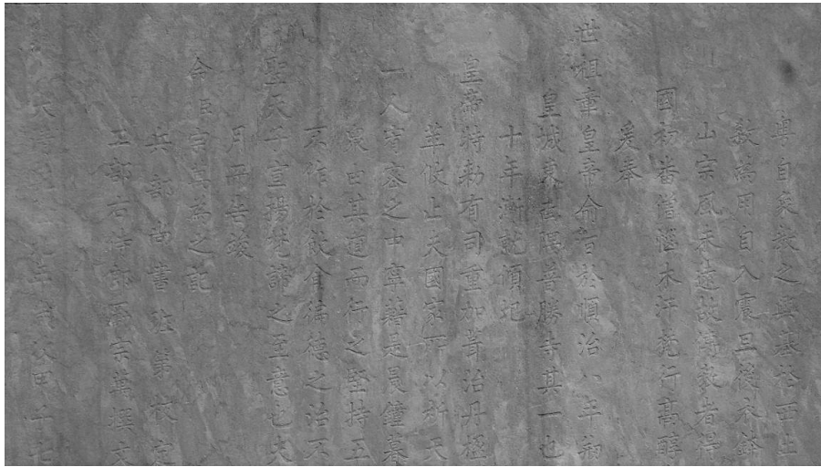
Figure 4: Chinese inscription