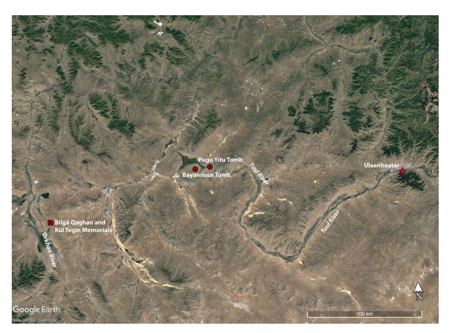
Map 1: Tang-Style Tombs in Central Mongolia

(r. 627–649) and his son Gaozong (r. 649–683), but only offer brief accounts. The Pugu, comprising 30,000 tents and 10,000 soldiers (XTS 217b: 6140; TD 199: 5466), were one of seven tribes that consistently belonged to the Tiele Confederation under the authority of the Türks until 630, the Sir-Yantuo to 646, and the Uighur thereafter.