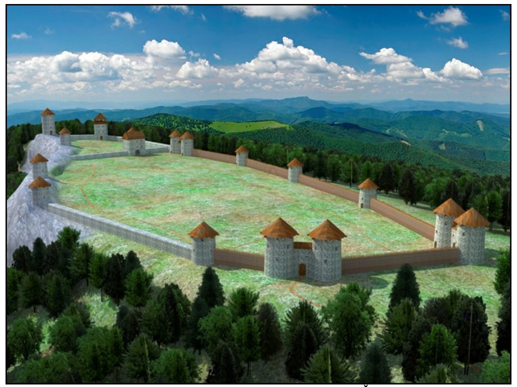
Fig. 3 Attempt to reconstruct Košice castle (L. Župčán)

From the triangular tower to the east, a perimeter wall with a length of approximately 35 meters stretched. The perimeter walls were interrupted in one place by an 8 meter opening, which evokes the main gate system (Fig. 3, Fig. 4 and Fig. 5).