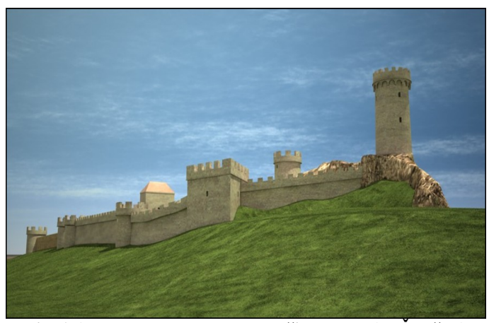
Fig. 1 Attempt to reconstruct Košice castle (L. Župčán)

Another depiction of the Košice Castle at Hradová has been preserved on cartographic materials dating back to 1780.<sup>99</sup> The main appearance of the castle is an oval, or ellipse, where three side objects, one larger-dominant, and two smaller architectural elements, are appropriately highlighted.<sup>100</sup> Even later historians and graphic designers preserved the elliptical form of the castle complex when creating the basic ground plan (Fig. 1 and Fig. 2). According to available data (J. Martinka), the perimeter of the castle complex (possible fortifications) was at least 1106 meters long.