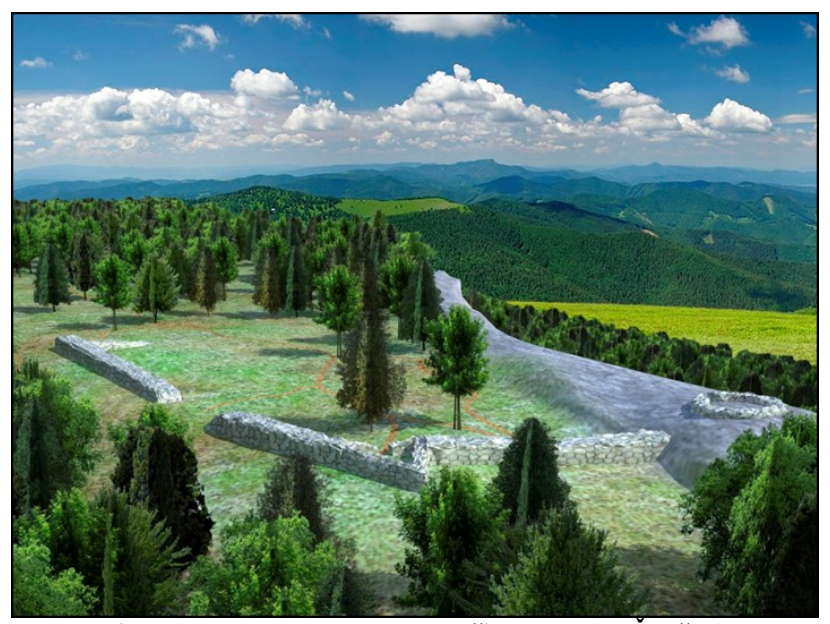
Fig. 5 Attempt to reconstruct Košice castle (L. Župčán)

The second important part of the inner castle was a round tower, located at the western end. This round tower ended the southern and also western castle perimeter wall of the