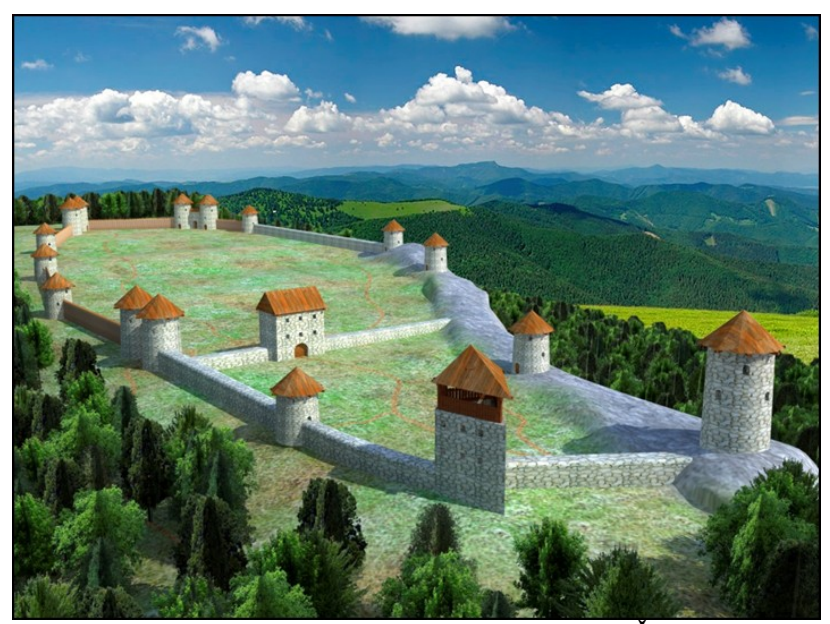
Fig. 4 Attempt to reconstruct Košice castle (L. Župčán)