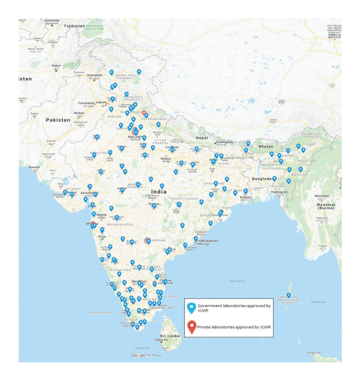
Figure 4. Map of diagnostic centre of COVID-19 disease in India approved by ICMR.

the mainland China, countries where the virus is on a rampage (Singh 2020).