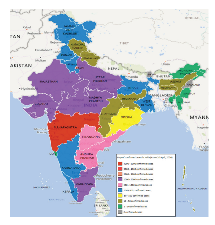
Figure 3. Map of COVID-19 pandemic prevalence in India.

asphyxia, tiredness and dry cough that are almost like common cold or flu (Huang et al. 2020). Some patients may have mild symptoms like nasal congestion, runny