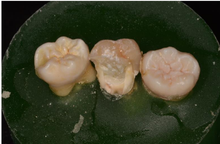
Figure 3. Fracture pattern deemed unrestorable as it extends under the CEJ.

Furthermore, apart from determination of the load required for fracture, evaluation of the fracture type is important from a clinical point of view. Thus, whenever conducting a load-to-fracture test, not only the fracture resistance, but also the failure mode should be evaluated. After the mechanical testing, the fractured specimens are examined regarding their fracture patterns. According to Scotti and co-workers, distinction is made between restorable or nonrestorable fractures under optical microscope with a two-examiner agreement. Based upon their evaluation system, a restorable fracture is above the CEJ, meaning that in case of fracture the tooth can be restored, while a nonrestorable fracture extends below the CEJ and the tooth is likely to be extracted [14] (Figure 3).