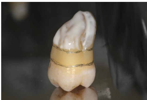
Figure 1. A layer of latex separator applied on the root surface before embedding.

Usually the first and most important step when testing tooth-restoration units is measuring fracture resistance. This can be performed in a static load-to-fracture setup with a universal testing machine. As stated by Ref. [5] static loading is usually the first step in the evaluation process of a novel dental materials and related techniques and is commonly used in order to obtain basic knowledge regarding the fracture behaviour and load capacity of a restored tooth. There are a number of factors that may interfere with resistance to fracture, such as the differences between specimens, tooth embedment method, type and direction of load application, crosshead speed, and simulation of thermal or mechanical fatiguing [6]. During this test intraoral conditions should be mimicked as much as possible. During the embedding of the samples two important elements should be emphasized: simulating the periodontal ligaments and simulating the bone level around the roots. In order the best mimic the elastic property of the periodontal ligaments, which normally connects the roots to the bone in a healthy clinical situation, the root part of the samples is covered with a layer of liquid latex separating material prior to embedding [7] (Figure 1.).