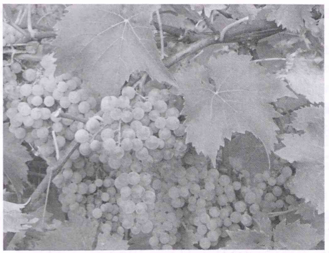
Figure 2. Mature cluster of 'Aletta'

The vineyards are planted at 3.0 \times 1.0 m spacing. The vines are trained with one trunk and one arm (height 0.8 m) and with simple spur pruning (6 buds per m^2 ). 'Aletta' was compared with 'Bianca'. 'Bianca' originated in Hungary by hybridizing 'Seyve-Villard 12375' with 'Bouvier.