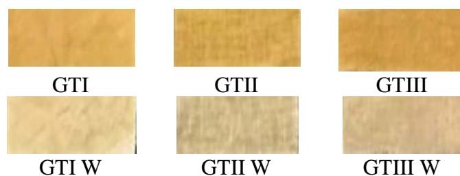
Figure 1. Appearance of the fabrics after dyeing (GTI, GTII, and GTIII) and after dyeing and one washing (GTI W, GTII W, and GTIII W)