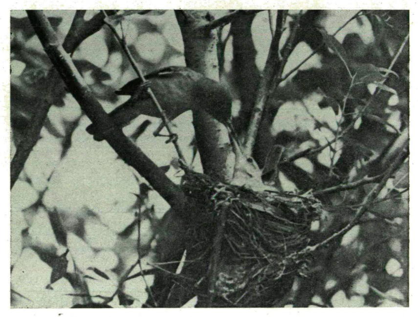
Fig. 2. A male scrub warbler just passing food to a hatching hen-bird.